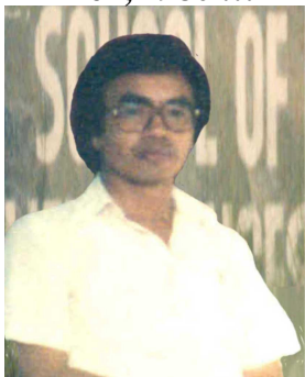
Then, 1980 ...